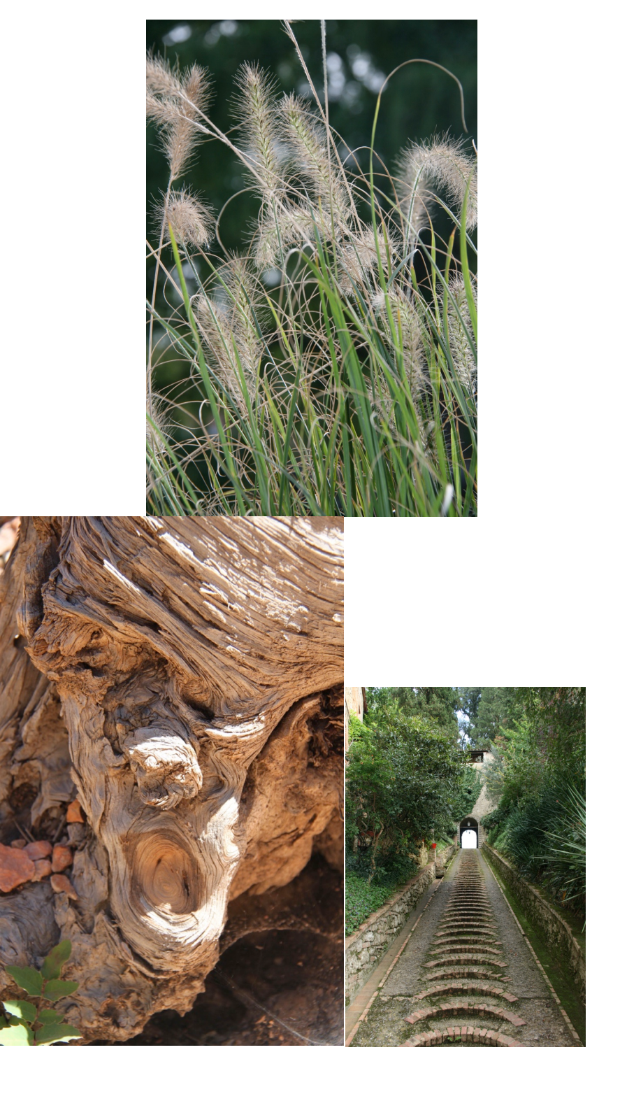
SDG 17 Means of Implementation