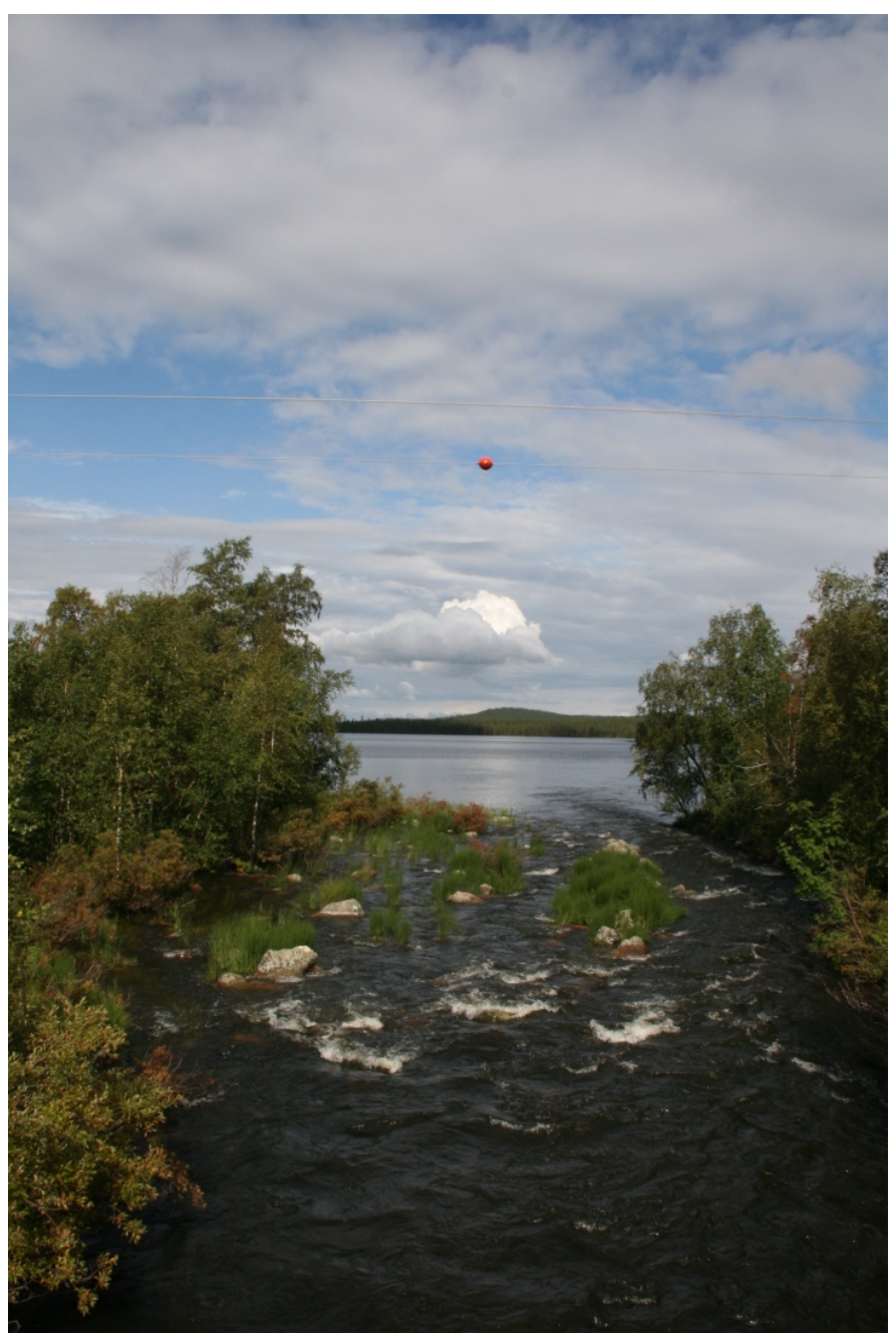
BEST PRACTICES ON INTEGRATING THE ENVIRONMENTAL PERSPECTIVE INTO THE IMPLEMENTATION OF THE SUSTAINABLE DEVELOPMENT GOALS

Integrating Nature while Implementing the UN's Sustainable Development Goals